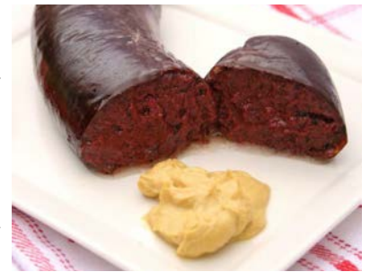
Blood sausage is a popular side dish in South America

Therefore, after considering these Bible passages, we can conclude that in every era of man's existence, God has commanded mankind to NOT eat blood. It was not allowed under the Patriarchal era, nor under the Mosaical era, or even now under the new covenant of Christ. So, it doesn't really matter how many cultures eat blood, or how common it may have become, God's will on the subject is all that matters. God's will is that His creation does not eat the very thing that gives it life and atonement (read Leviticus 17:11-12).