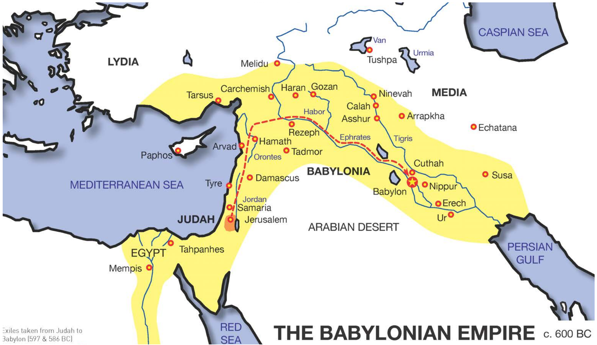
Exiles taken from Judah to Babylon (597 & 586 BC)